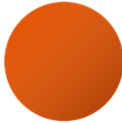
Primo Pure Orange 2004