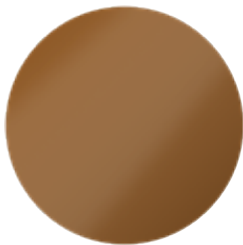
Primo Copper Metallic