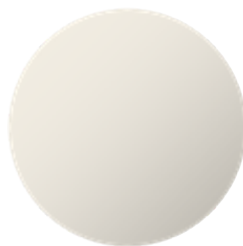
Primo Pure White 9010