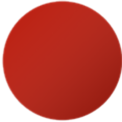
Primo Traffic Red 3020