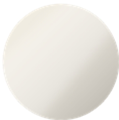
Primo Metallic White