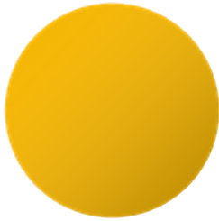
Primo Signal Yellow 1003