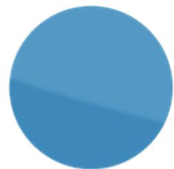
RAL 5012 Light blue glass