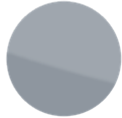
RAL 7045 Tele grey glass