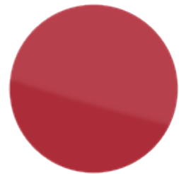
RAL 3020 Traffic red glass