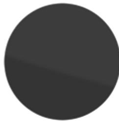
RAL 9017 Traffic black glass