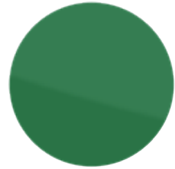
RAL 6029 Mint green glass