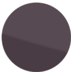
RAL 4007 Purple violet glass