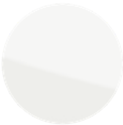
RAL 9003 Signal white glass