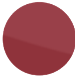
RAL 3002 Carmine red glass