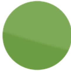
RAL 6018 Yellow green glass