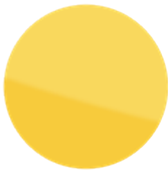
RAL 1018 Zinc yellow glass