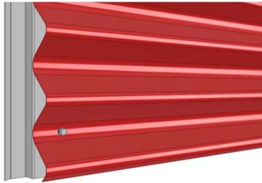
1. Add fasteners to the lowest wave bottom